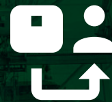
Supply Chain Solutions